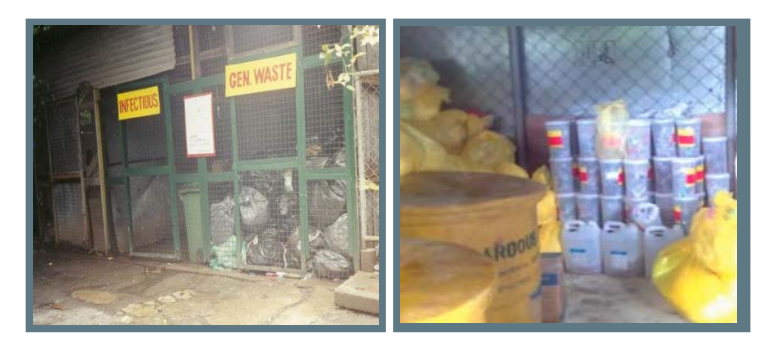
Photos show the waste storage area of Hospital D for general and infectious waste and the storage area of Hospital A for infectious waste.

The storage areas have designated areas for different types of waste, ensuring that waste is segregated until final disposal. Well-designed storage areas are spacious, easy to clean, located far from patient areas and secured by gates and locks. For some hospitals, the storage areas are opened only in accordance to the collection schedules.