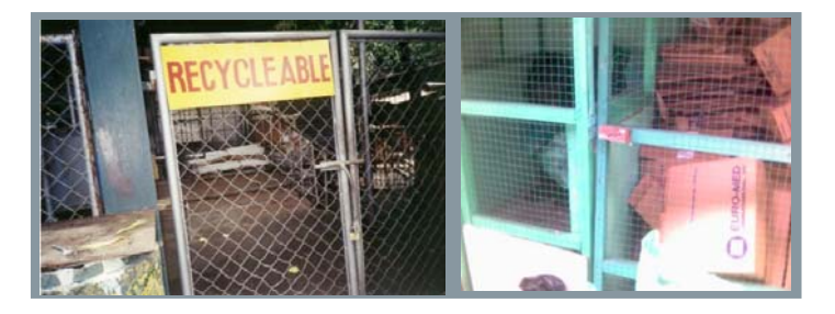
Left: Spacious storage facility for recyclables at Hospital D; Right: Storage for recylables at Hospital B, photo shows collected cartons ready for selling.

Dedication of ample storage space for collected recyclables. Recyclables are easier to sell when sold in bulk.